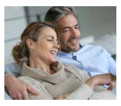
08 TAXING TIMES

PROTECTION SOLUTION Helping you feel confident your family's finances are secure